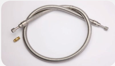
Flexible Fill Hose with 1.27 cm I.D. includes dual swivel connectors and a 3/8" male NPT adaptor included with purchase.