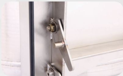
All units include a mechanical step lock for securing the step when stowed