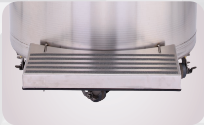
Integral folding step with slip-resistant surface